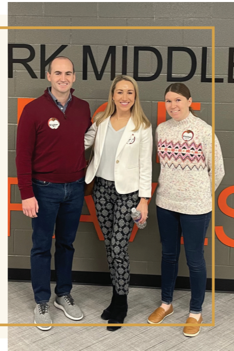
EVERFI classroom visit 2023