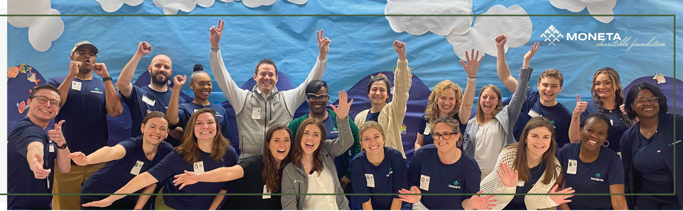
Moneta volunteers boost JA-in-a-Day